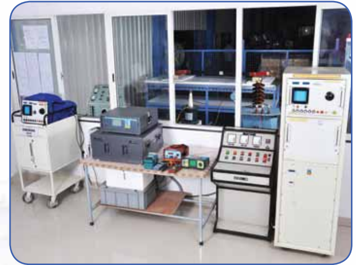
Coils Testing Lab - I

We test all our coils for any standard specified by customer, eg. ESI 44/5, ESI 44/7 Etc..