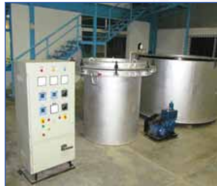
VACUUM ANNEALING FURNACE