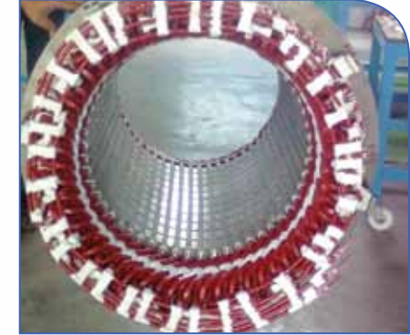
WINDING OF 3PHASE AC TRACTION STATORS