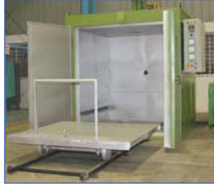
BAKING OVEN - 600° C