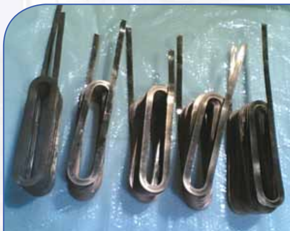
DC TRACTION INTER POLE OR COMMUTATING POLE COILS – BARE FLAT COPPER EDGE WOUND