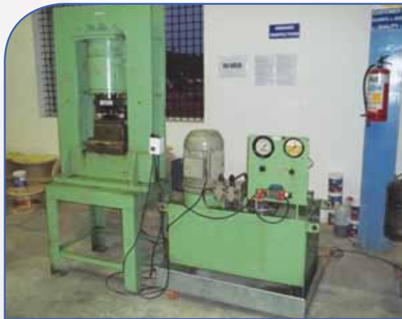
LEADS SWEDGING MACHINE