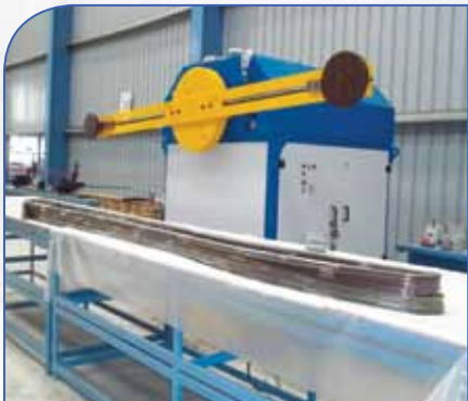
HEAVY DUTY LOOPING MACHINE