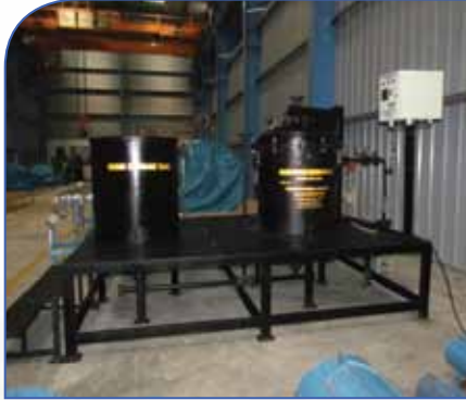
VPI PLANT - 800mm Dia x 800mm DEPTH