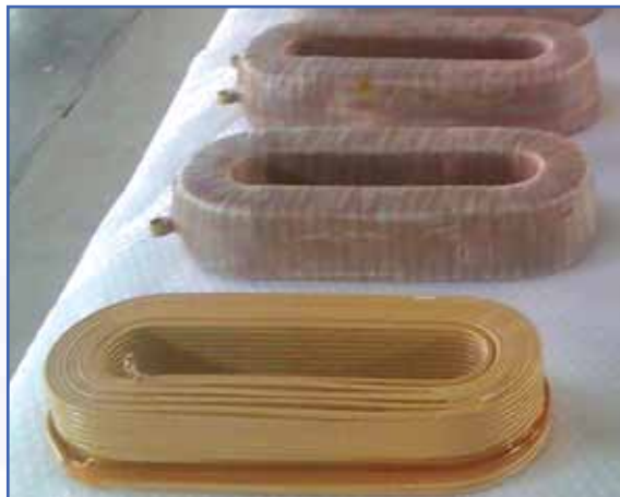
DC TRACTION INTER POLE OR COMMUTATING POLE COILS – STRIP COPPER WOUND