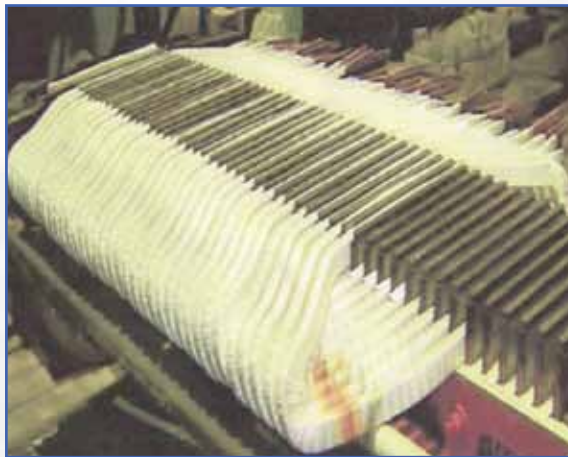
AC TRACTION STATOR COILS FOR LINEAR MOTOR