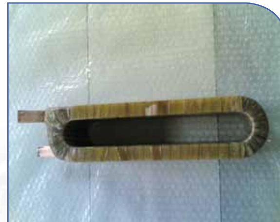
DC TRACTION INTER POLE OR COMMUTATING POLE COILS – REINSULATION