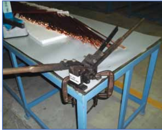
V BENDING MACHINE