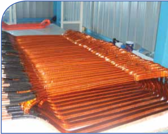
AC TRACTION STATOR COILS