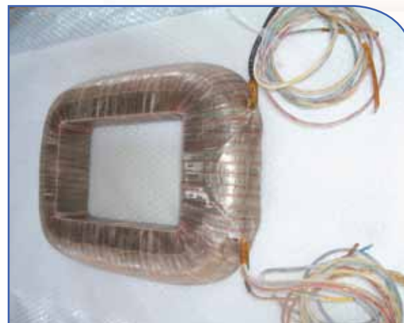
DC TRACTION MAIN POLE COILS WITH ROUND COPPER AND STRIP COPPER