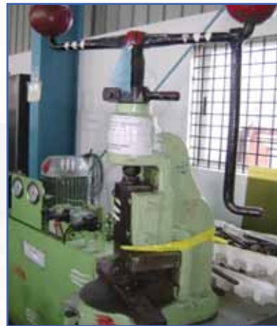
LEADS RADIUS CUTTING MACHINE