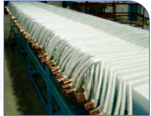
DC TRACTION ARMATURE COILS - WAVE WINDING