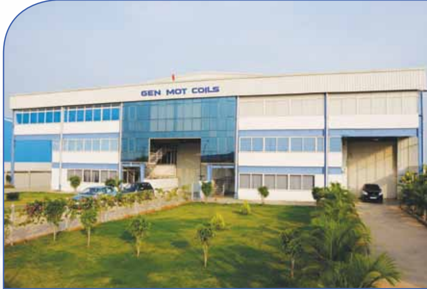
UNIT - I : 35,000 Sq Ft (3,500 Sq Mtrs)