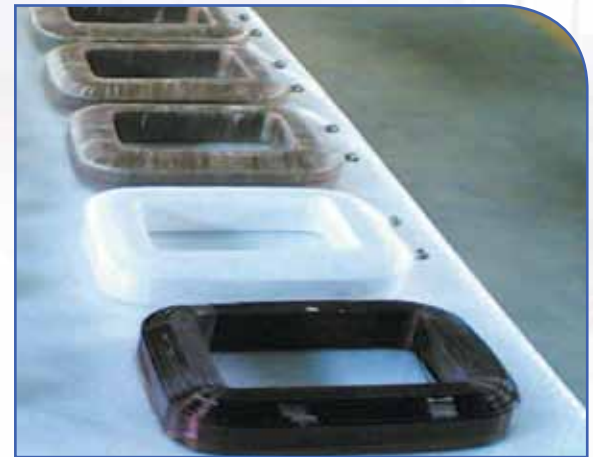
DC TRACTION MAIN POLE COILS - STRIP COPPER WOUND