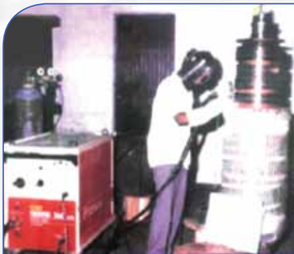
TIG WELDING MACHINE