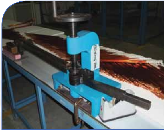
U BENDING MACHINE