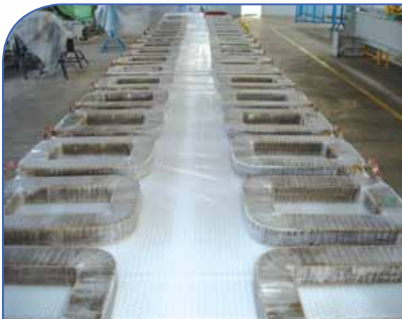
DC TRACTION MAIN POLE COILS – BARE FLAT COPPER WOUND