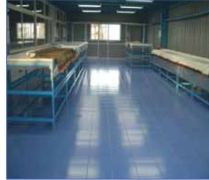
DUST PROOF INSULATION TAPING ROOM