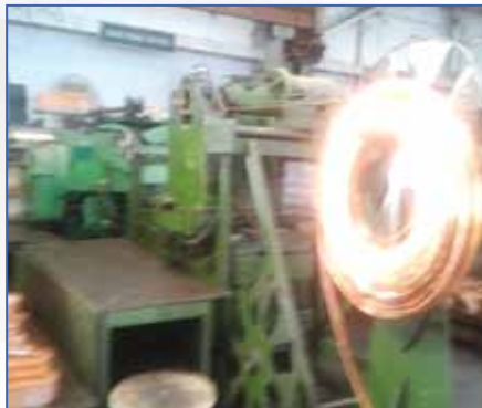
AUTOMATIC EDGE WINDING MACHINE OF LENGTH 1MTRS