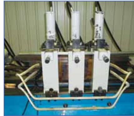
HYDRAULIC COIL MOULDING MACHINE