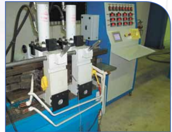
HYDRAULIC COIL MOULDING MACHINE