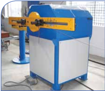
LOOPING MACHINE UP TO 1.5 MTRS LOOP LENGTH