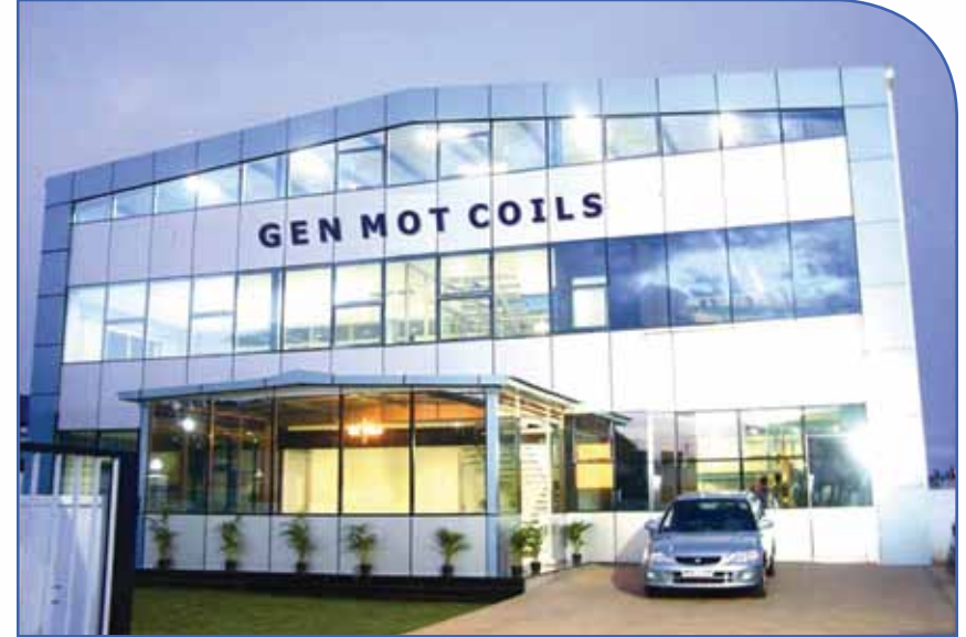
UNIT - II : 20,000 Sq Ft (2,000 Sq Mtrs)