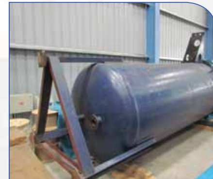
VPI PLANT - 1.5MTRS DIA X 3MTRS DEPTH